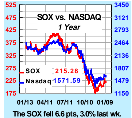
The SOX fell 6.6 pts, 3.0% last wk.

iSuppli said global sales of DRAM chips are expected to fall 4% in 2009, to $24.2 billion, after falling 19.8% in 2008, to $25.2 billion, and extending their decline for the third straight year amid a prolonged industry downturn and chronic oversupply.